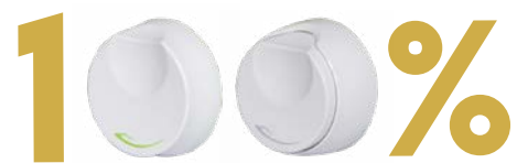
DIMPRX (No Glow)